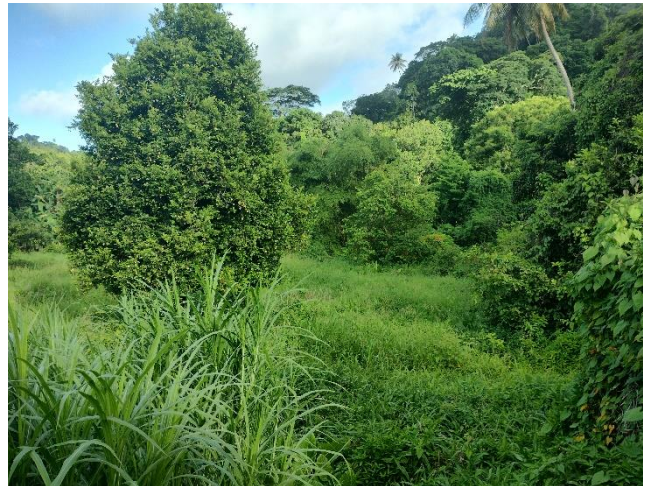
Figure 2.5: Photograph of site C (pump station location)