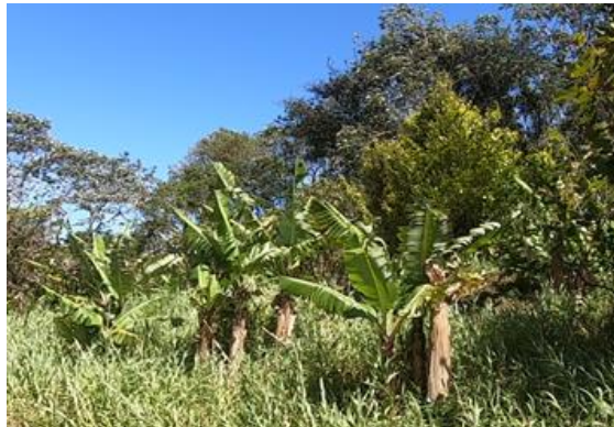
Figure 2.7: Photograph of site F