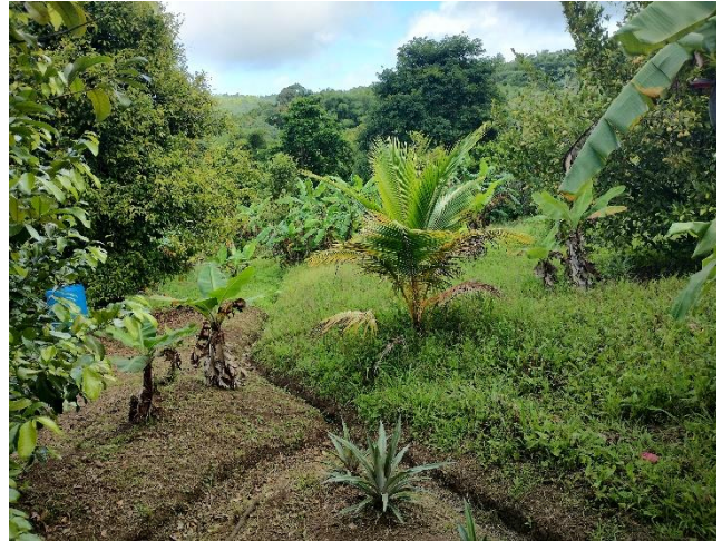
Figure 2.3: Photograph of site C (well pad location)