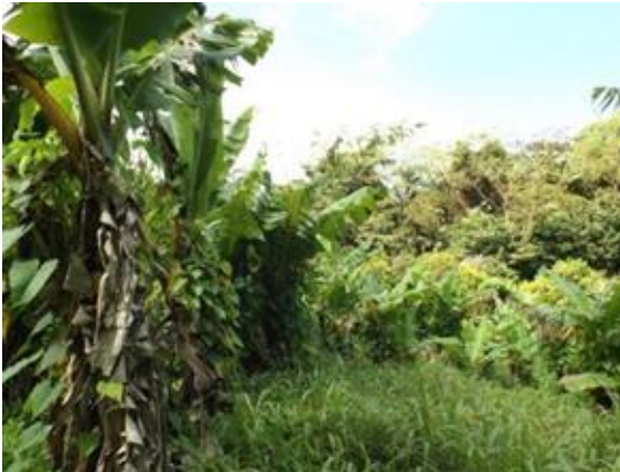
Figure 2.8: Photograph of site F (banana plantation)