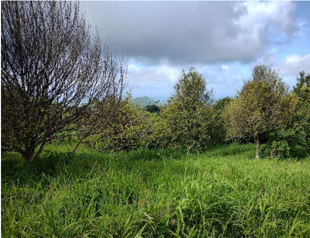
Figure 2.2: Photograph of site C (well pad location)