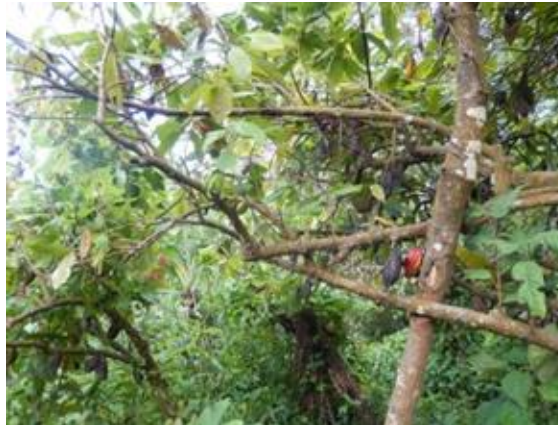
Figure 2.9: Photograph of site F (cocoa plantation)