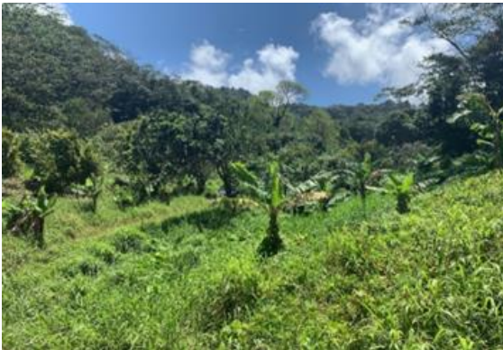
Figure 2.6: Photograph of site F