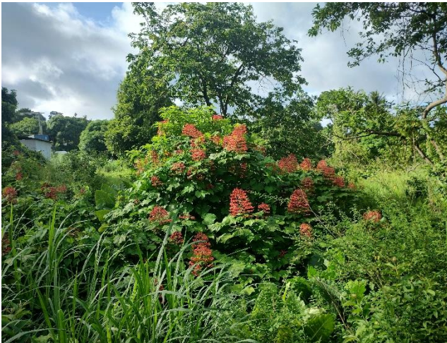
Figure 2.4: Photograph of site C (pump station location)