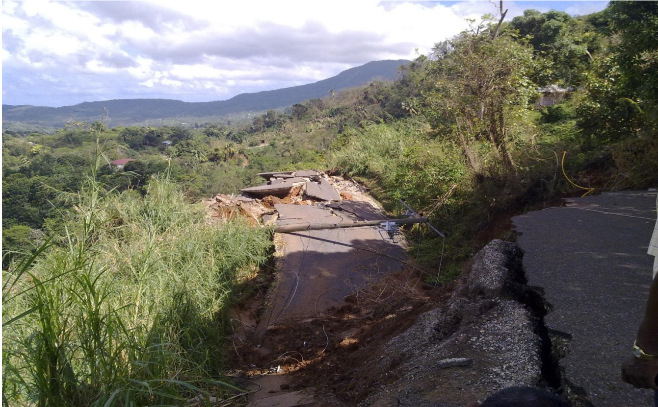
Guesneau, St. Lucia Hurricane Tomas (October 2010)