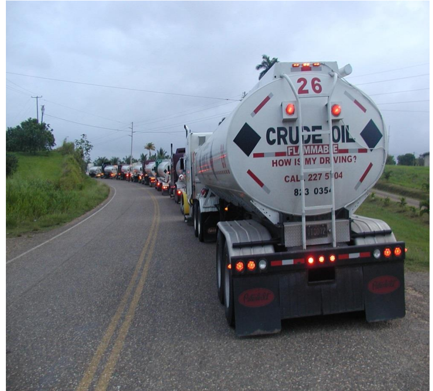
Kendal Bridge, Southern Highway, Sittee River, Belize Tropical Storm Arthur (2008)