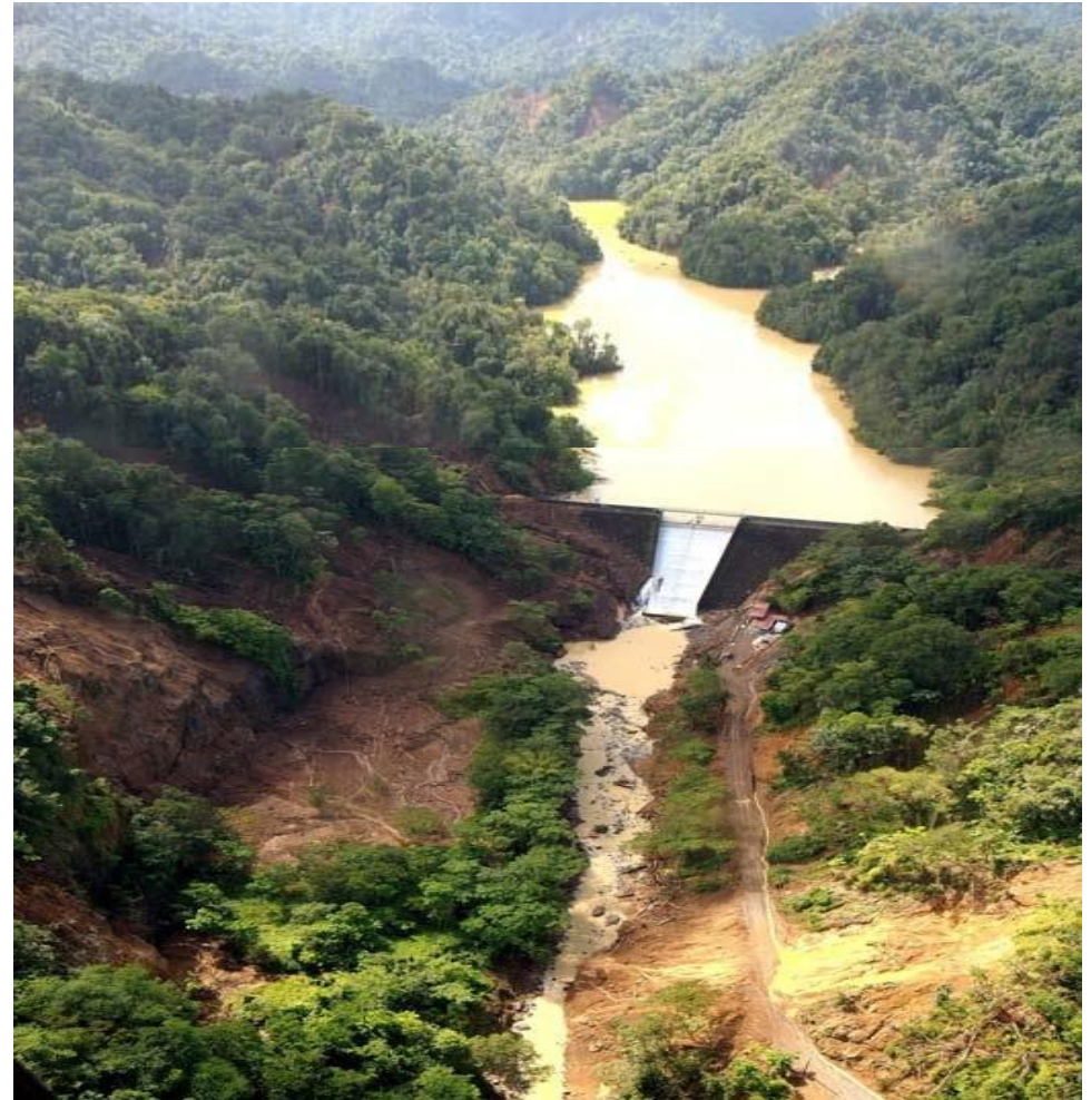
2010 Hurricane Tomas Roseau Dam, St Lucia