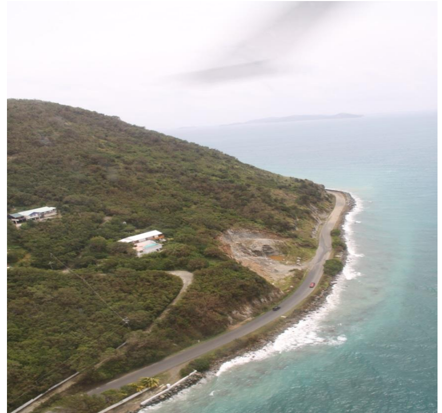
Tortola, British Virgin Islands Storm Otto (October 2010)