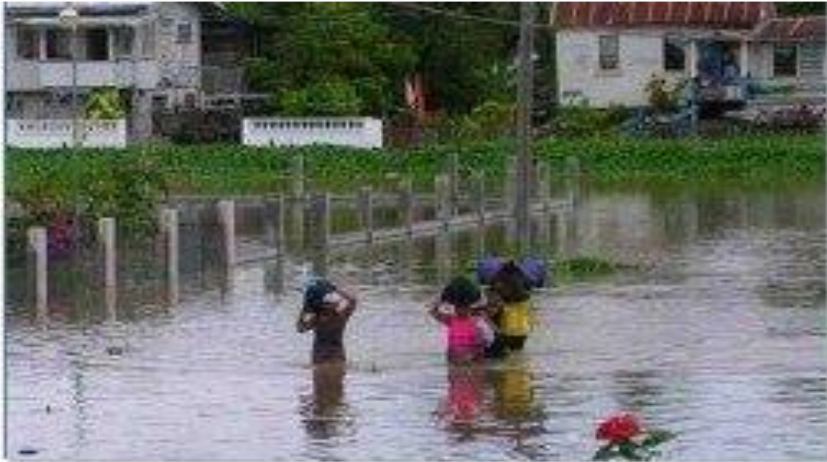
Scene of flooding