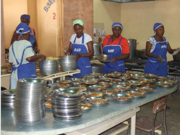
Workers in school feeding programme at L'École Jn Paul II, Fleuriot - EFA