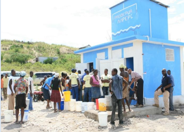
Potable Water Supply System