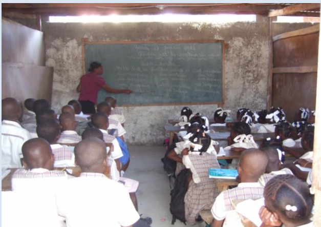
Students at ADEG Primary School in Port-au-Prince - EFA