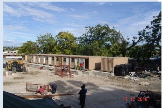
New Temporary Offices under construction for GOH agencies within the Ministry of Public Works, Transport and Communications