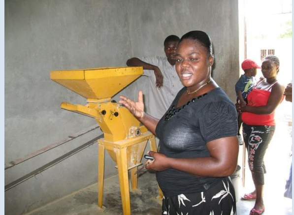
Women's Group Corn Milling Project