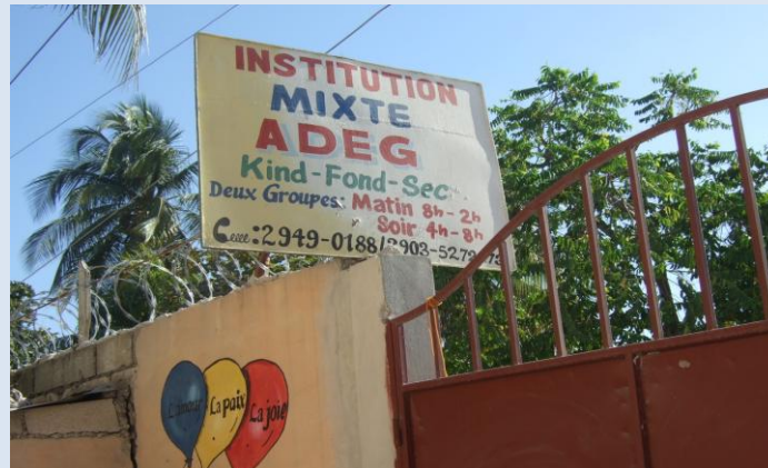
One of the schools benefitting from the tuition subsidies - EFA