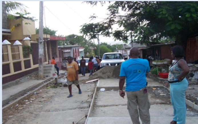
Improving Village Roads