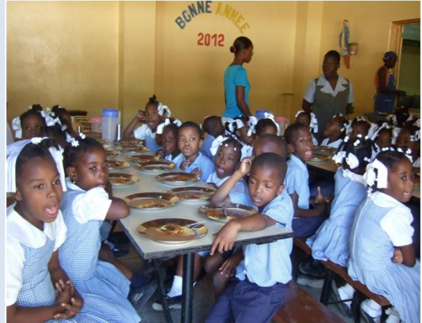
Children at L'École Jn Paul II, Fleuriot, enjoying a meal of rice, stewed red beans and herring