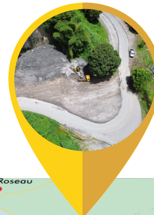
Aerial View of Road Construction on Dominica's UKCIF Project - Advancing Resilient Connectivity through Challenging Terrain - September 2025