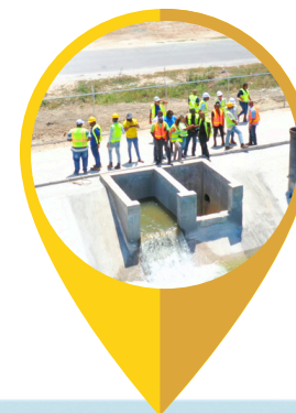
Project Team Conducting Inspection at Amity Hall Reserve - Aerial View. - April 2025